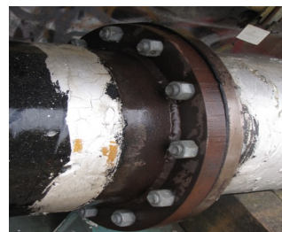
Water main junction cleaned up for inspection & recoating