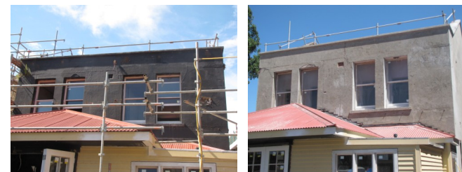
Campbell Free Kindy Before After removing 10+ coats