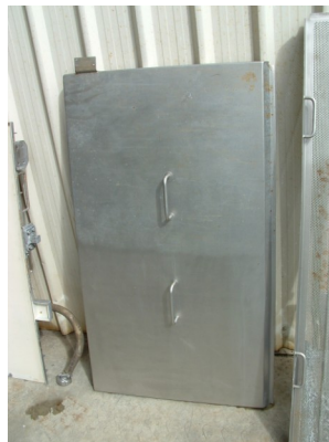
Upper section before blasting

The blast media is not trapped in small cracks and cavities. It simply washes out.